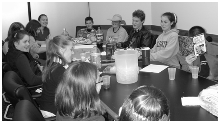
Teens attending a recent Murder Mystery Dinner