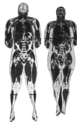
Visible Humans Computerized images National Library of Medicine