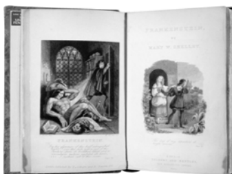
Mary Shelley Frankenstein; or, The Modern Prometheus London, 1831 Singer-Mendenhall Collection, Annenberg Rare Book and Manuscript Library, University of Pennsylvania

The Library is offering a series of free lectures, a film series and other events in May for the public in connection with the exhibition.